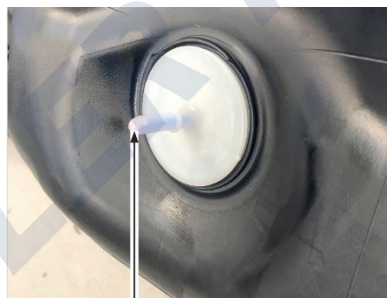
Figure 1 Auxiliary Fuel Port

Feed the Remaining line to the fuel pump and secure using the remaining rubber hose and clip.